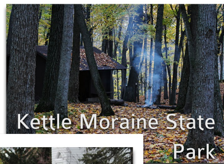
Kettle Moraine State Park