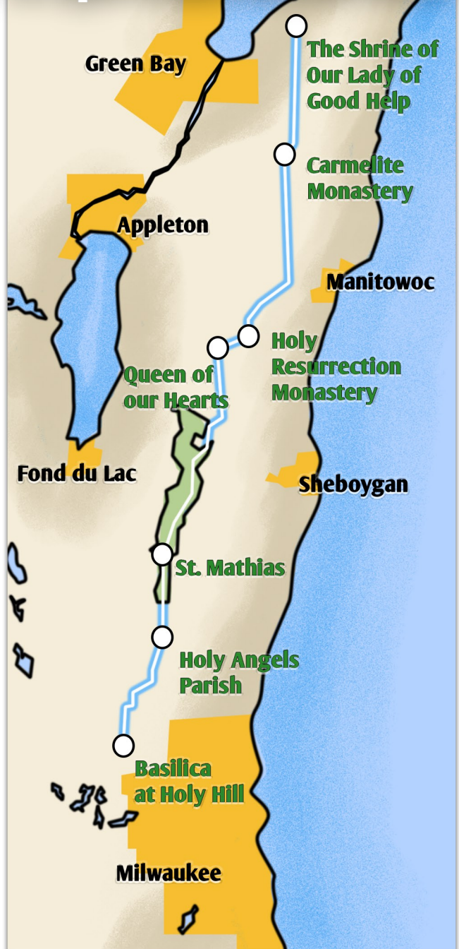
The Shrine of Our Lady of Good Help