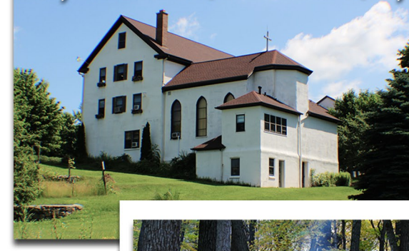
Holy Resurrection Monastery

End with Mass at the National Basilica of Mary, Help of Christians at Holy Hill